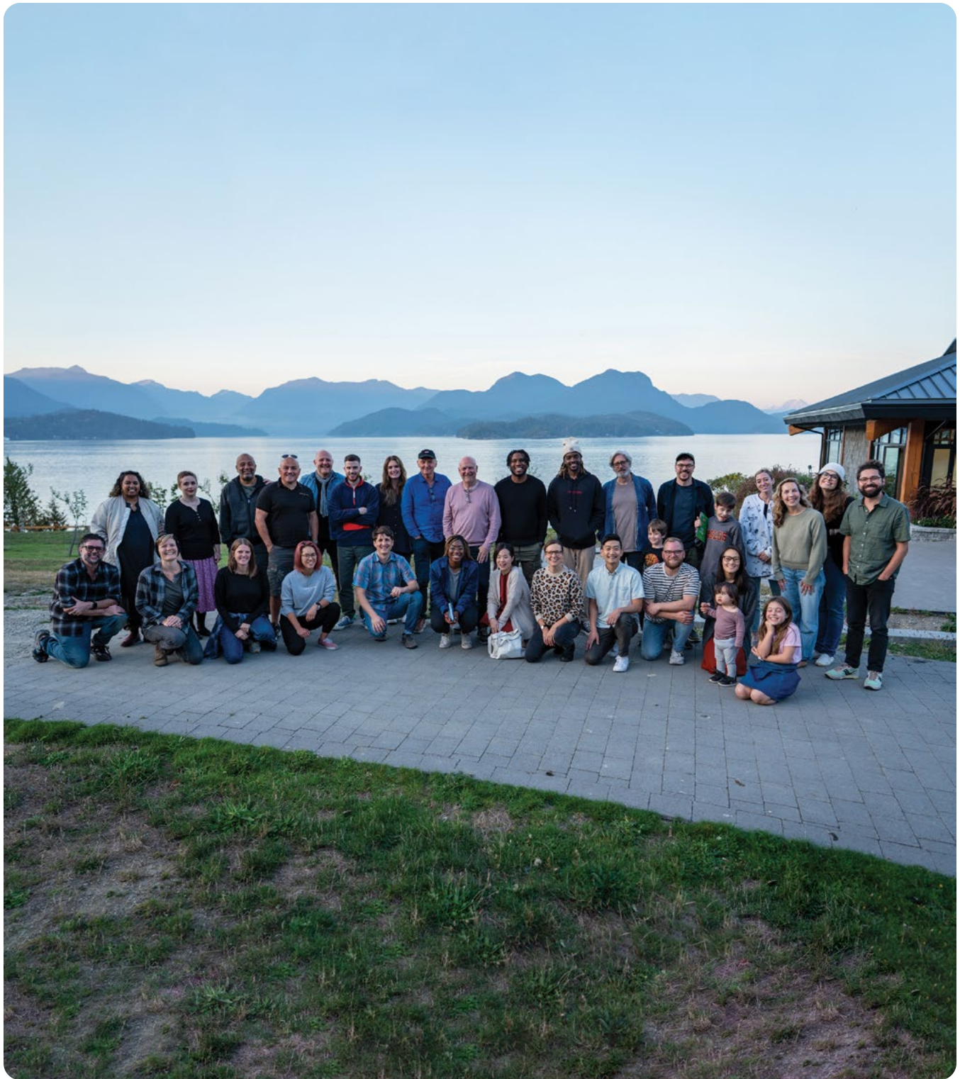
Songwriting Retreat for Sanctuary Songs Album | Keats Island, BC | October 2022