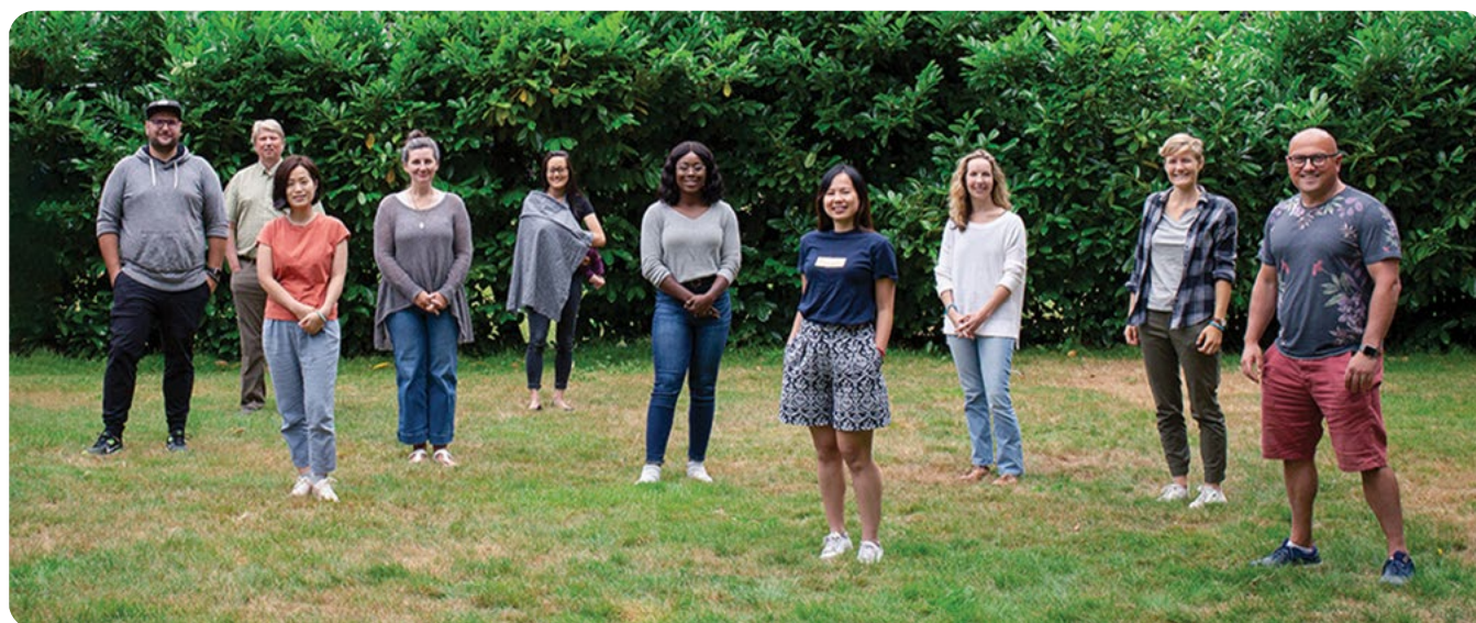
Sanctuary Team Photo – July 2021